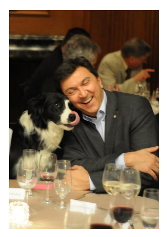
Everyone had a great time at the Canadian Association of Rhodes Scholars Reunion Weekend!