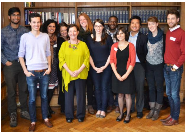
The Honourable Justice Rosalie Abella of the Supreme Court of Canada, and member of the Ontario Rhodes Selection Committee, meets with Canadian Rhodes Scholars-in-Residence (May 2014)