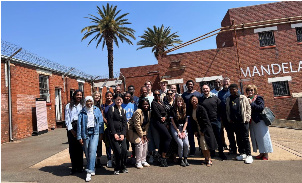
Rhodes Alumni and Scholars-Elect group visit to Constitution Hill, 01 September 2024

As the Class of 2024 prepares to travel to the UK later this month, SAARS wishes the Southern African Rhodes Scholars-Elect (2024), Bon Voyage and every happiness and success in Oxford.