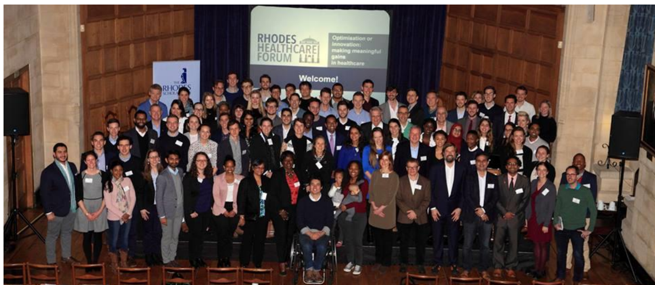
Attendees of the 2016 Rhodes Healthcare Forum in Milner Hall